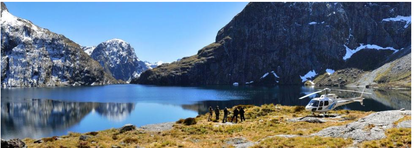
Kayaking in Auckland, cottages at Wharekahuau and Fiordland remote landing